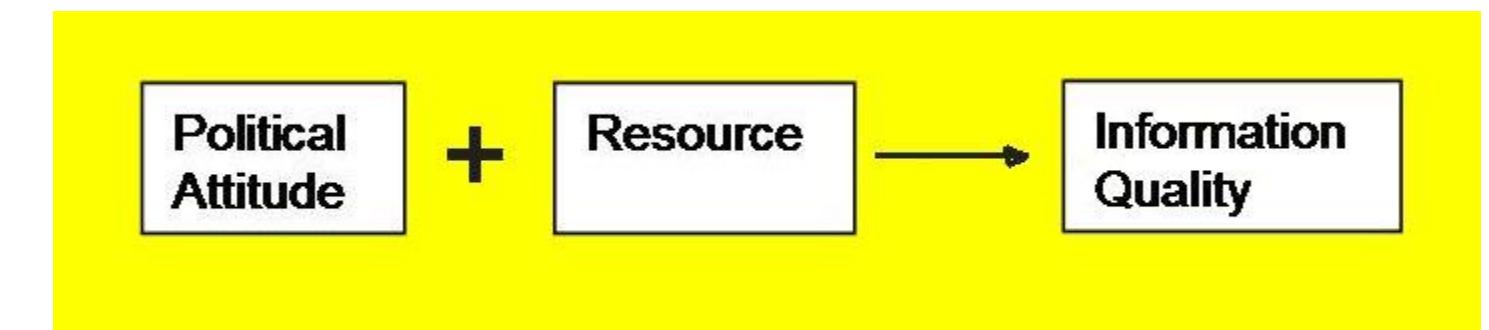
Figure 1: Conceptual model of factors influencing quality of information.

The model in Figure 1 shows the conceptual relationship among these questions. The proposed model shows that political attitudes combined with the level of resources available to an organization could affect the quality of the information on any given Website. The concepts political attitudes (that is, bias or stance) and resources have been operationalized for the present study by examining several variables. By bias we mean how the Website's sponsor views genetically modified (GM) crops or food and how strong the attitude might be regarding the benefits or disadvantages of growing genetically modified crops and using genetically modified food. A bias score was assigned to a Website using one of five levels that range from 'Very Opposed' to 'Very Favorable' towards genetically modified (GM) food; for example, Friends of the Earth, an environmental organization, is extremely opposed to genetically modified food so their Website received a rating of Very Opposed for bias.